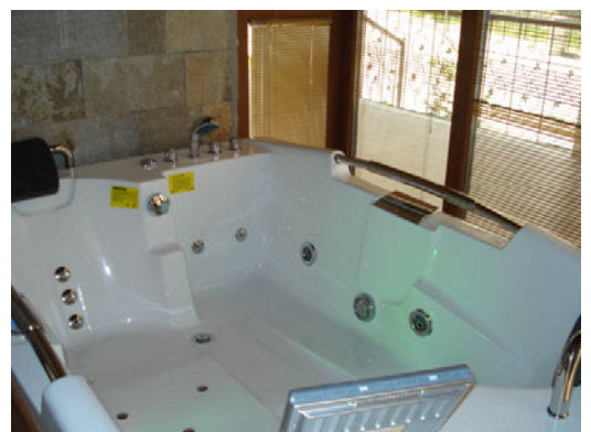
...and spa in the Elegance 3 complex.